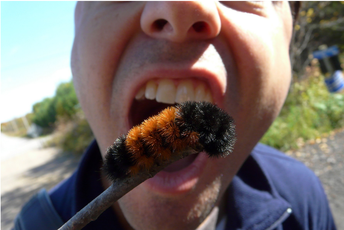
Fig. 7, personal collection, Fall 2008

In addition, the photograph in Fig. 7 demonstrates that the source of the humor is in our anticipation of a future viewer's reaction. Unfamiliar with the dramaturgy of the picture-taking context one may actually imagine that the demonstrated desire to swallow the caterpillar was genuine and promptly satisfied.