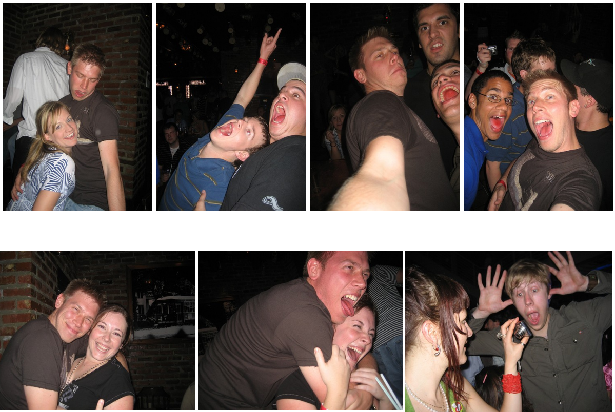
Fig. 3: Pete the Great, “Trip Home” - party sequence, 5 out of 114, posted on Flickr 2007 http://www.flickr.com/photos/gustavthree/

If the analysis of the isolated digital image demonstrates the predominant presence of interactive processes of signification, the consideration of the same photograph in the context of its digital sequence substantiates it in terms of representation. Impenetrable on its own, the singular image contributes its segment of visual information to the puzzle of the digital stream to formulate a continuous narrative. Meaning surfaces in result of occurring trends and patterns of signification. Thus, for instance, the greater number of photographs allows a glimpse into the setting (See Fig. 3). In the dark background of some of the pictures one can notice that the event is taking place in a public place – most likely a pub. Often images follow one after the other with only a slight difference in content, like the shots in a film, they trace the progression of the ongoing action. People