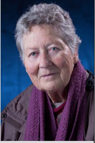
Experimenting with making the background look more natural, by moving the background flash unit.