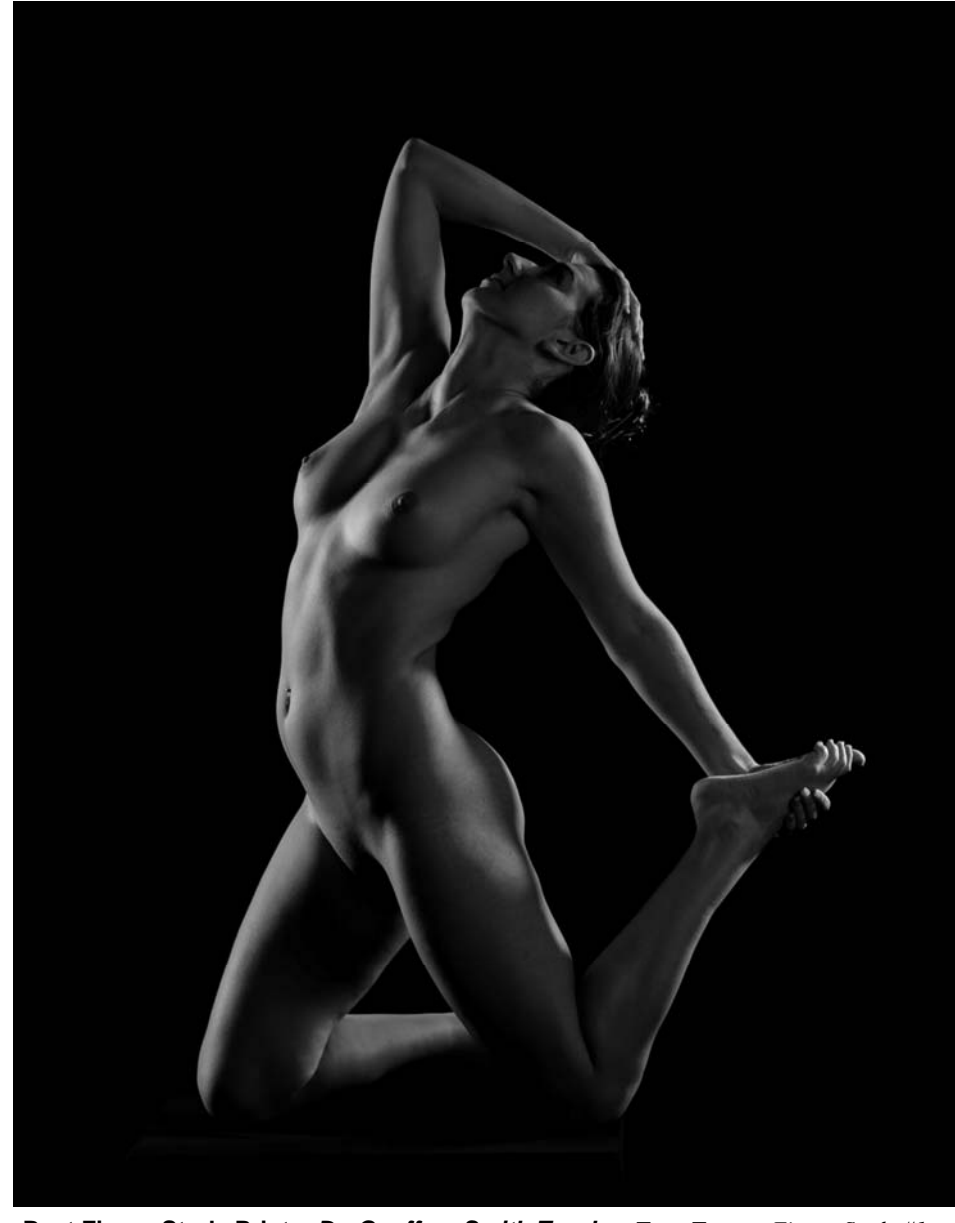
Figure Study #1