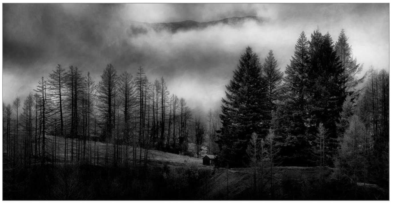
Land, Sea or Cloudscape Print