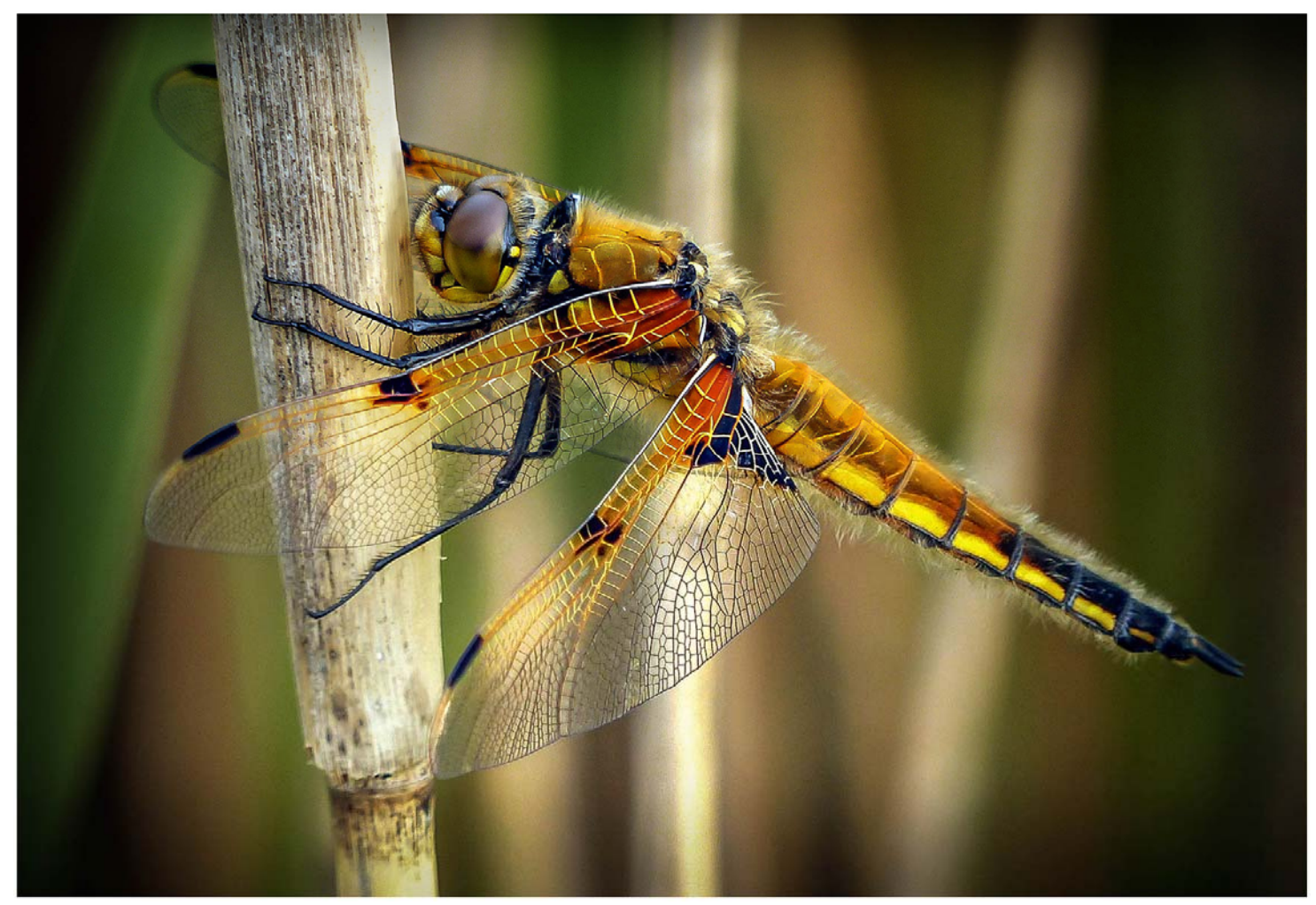
Michaels Camera Video and Digital Best PDI