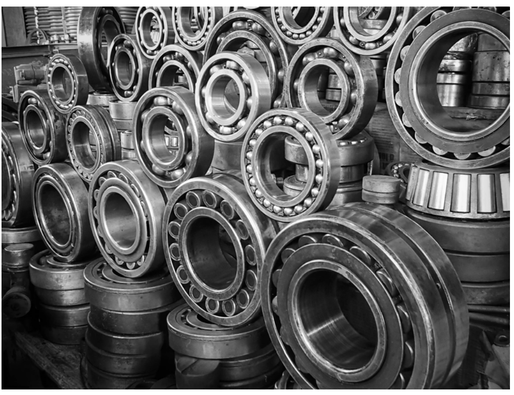
Bearing it all

However, over the years my limited and outdated photographic equipment was not quite up to standard compared to what is available in stores nowadays. So, after an inspiring and encouraging 2016 yearly competition at the club, I spoiled myself and bought a new Fujifilm X-T2 camera with three supplementary lenses, which now gives me another learning challenge ahead. Like many photographers, as the interest grows the choice of subjects to shoot becomes more refined. However, I still have not chosen a specialty in photography as I enjoy shooting many kinds of subjects. In the meantime, I will keep on having fun with this great hobby, and look forward to even more challenges ahead.