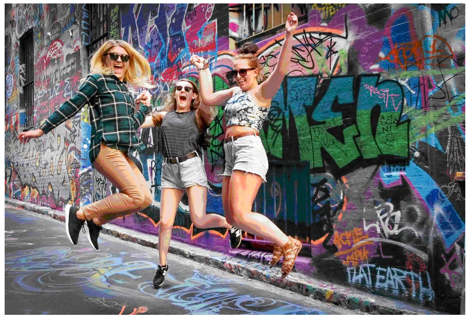
Tourism Victoria - Michaels Camera and Digital Award