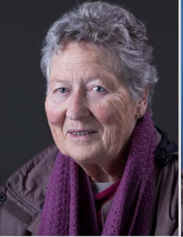
Reflector board added to fill in some shade