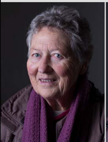
Single flash bounced off a large reflector.

Our Magazine Editor Sue Rocco came along to an evening session where we had divided into groups to practice our portrait lighting. The photographs with this article show the lighting concepts the group was experimenting with on that evening. None of the photos have been edited, apart from cropping to a suitable size.