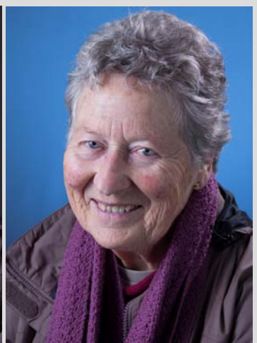
Hair light added, and background colour added using a flash with a colour gel