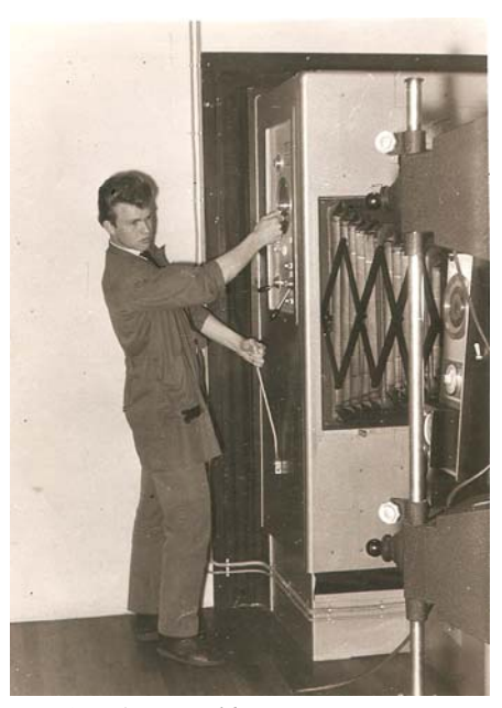
As a 17 year old Camera Operator