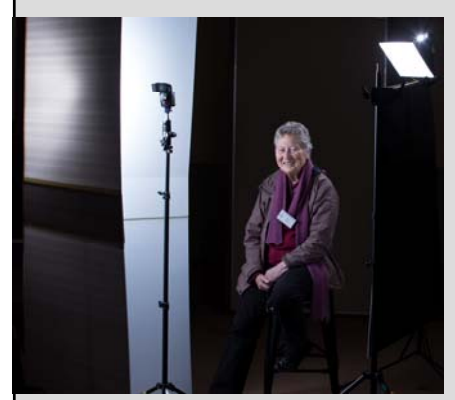
The lighting setup

Leveryone with a smartphone can now be a photographer. They see something interesting, they snap the photo. The camera electronics take away the need to know about things like shutter speeds and f-stops, and if the lighting and composition happen to be suitable, it may even be a great photo.