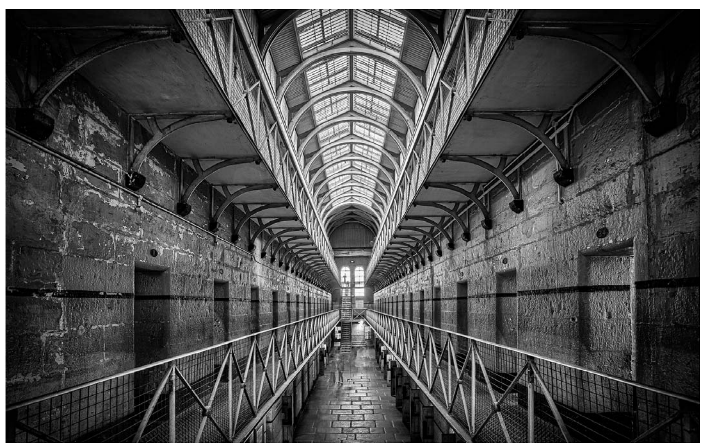
Best Open PDI