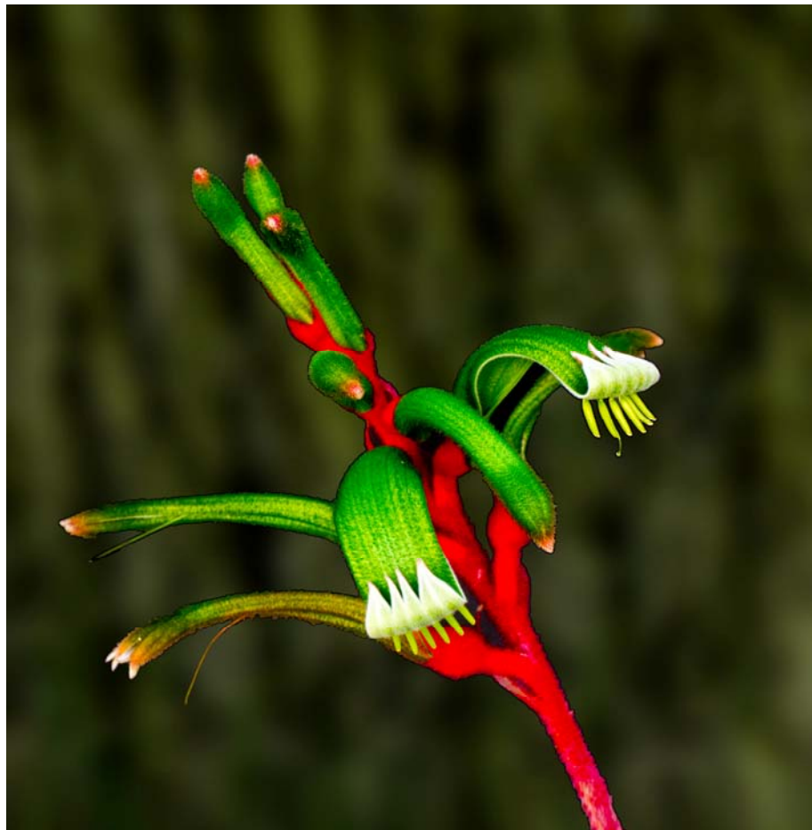
Photo 3 - Flower on natural blurred background

Flower photography is a specialized art, and something I have little experience in. Having better equipment would also help. With my camera, I can't really go past f/11 to improve depth of field as diffraction blurring starts to occur. A full frame, or even better, a medium format camera with macro lens will give better results as the aperture can be wound down to f/16 or f/22 to give a much better depth of field.