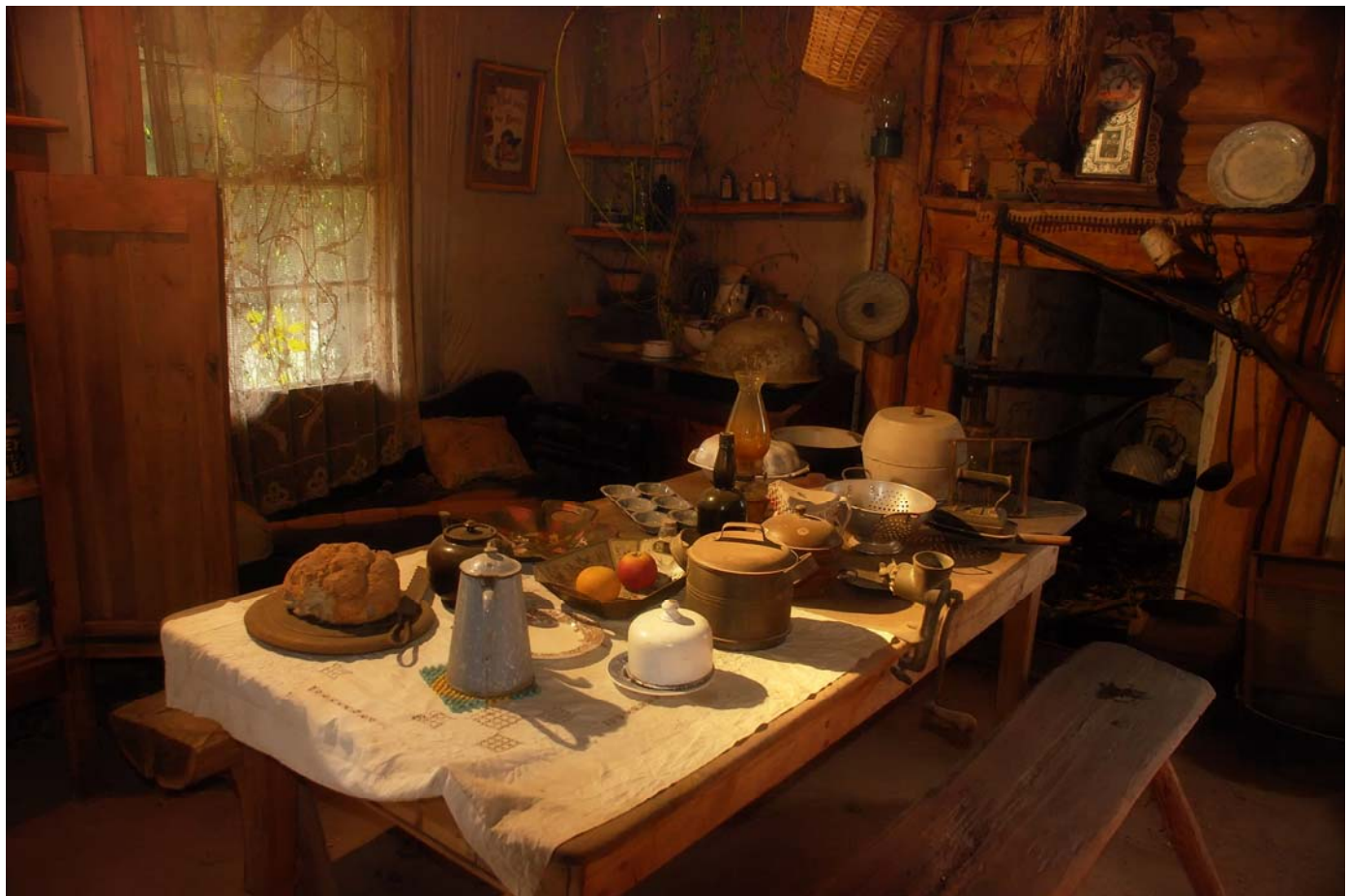
August colour PDI of the month