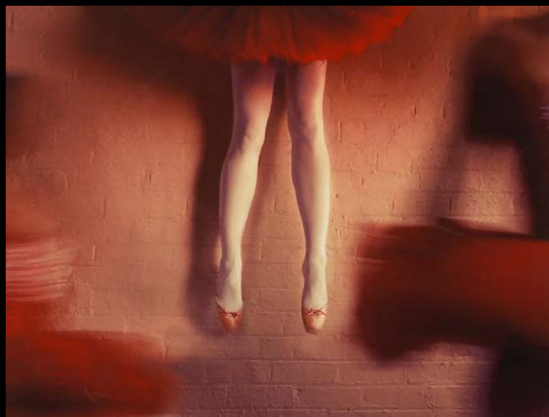
Ria Ganis The dance ends 10