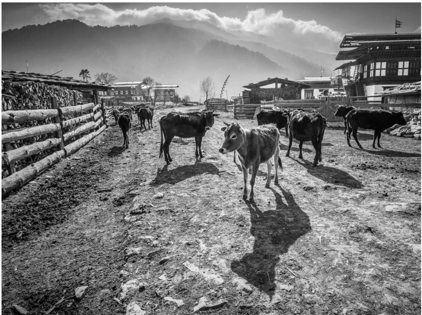
September mono print of month