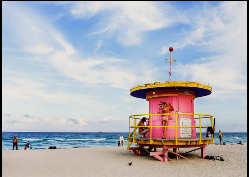
Judi Mowlem South Beach Babe 10