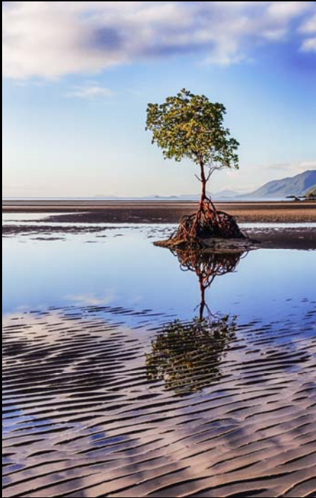
Neil Brink Lummi Island crab fishing shack 12