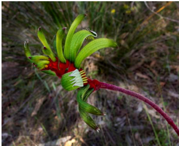
Photo 1 - Natural environment

I am primarily a landscape photographer, so when it comes to macro photography or flower photography I am somewhat out of my depth.