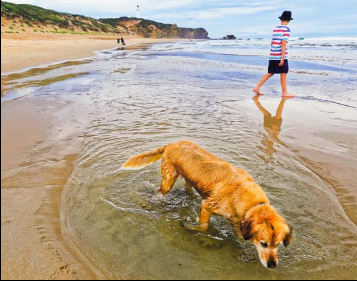
Guy Toner Dog in a pond 10

Yes, it is a long time since VAPS but we just have not had these available till now, or the space for them. The score given for each image is on the right side of caption.