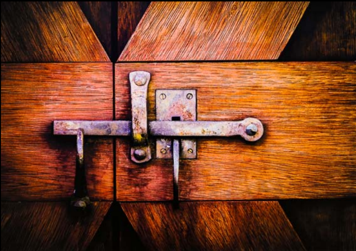
Daryl Lynch The lock 11