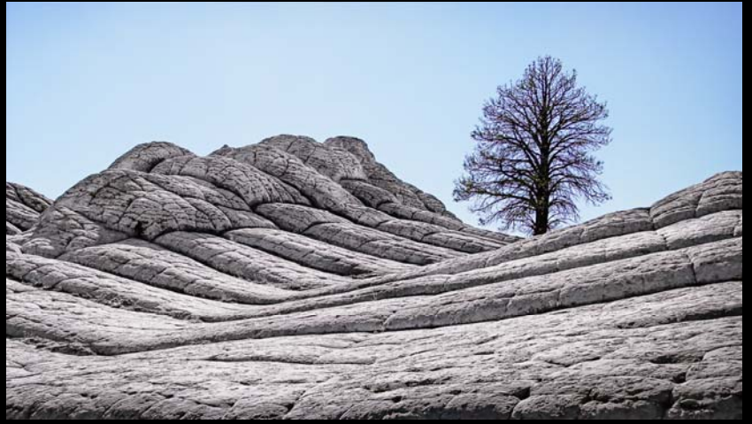
Ken Bretherton White pocket tree, Arizona 9