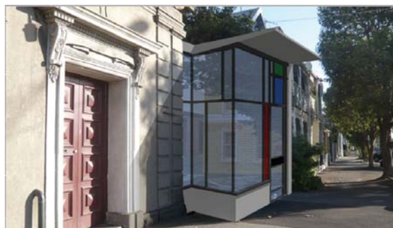
Artist's impression of new entry