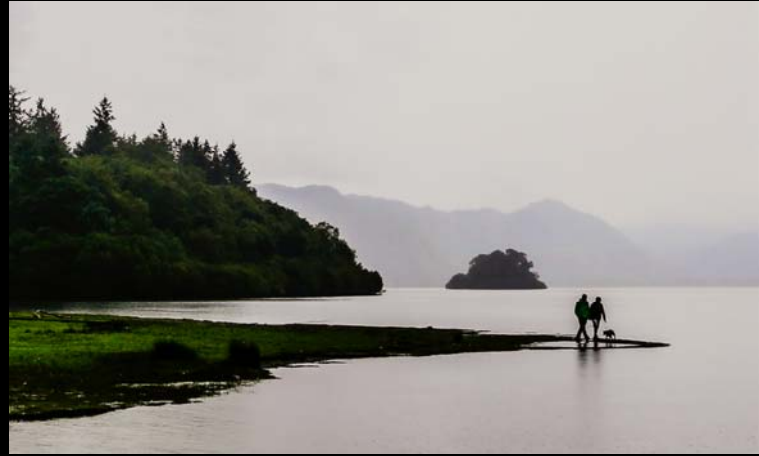
Brian Seddon Lake District Walk 14