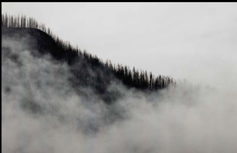
Neil Cunningham After the fire 8