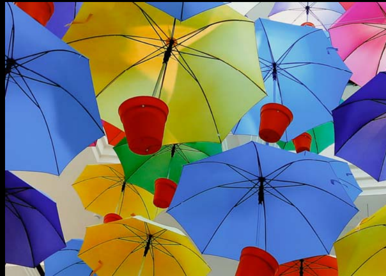
Jim ODonnell Decorations 10