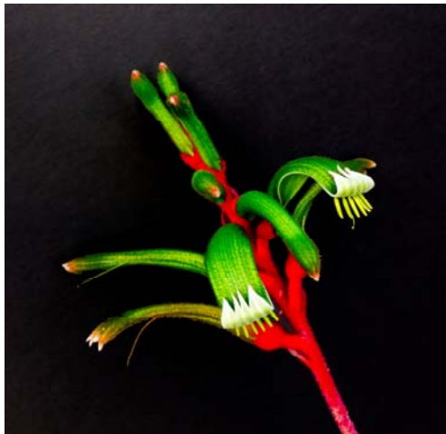
Photo 2 - With black card background

Photo 1 shows a typical example of a natural shot with some background treatment, quite a nice specimen, but spoilt by a messy background. The idea that I came up with may not be new, and would possibly horrify the purists, but gives a much better result. On a subsequent visit, I brought along a flat black card. By placing this behind the flower I produced what I would call a flower "portrait". The flower is completely isolated from the background. Photo 2 is the result.