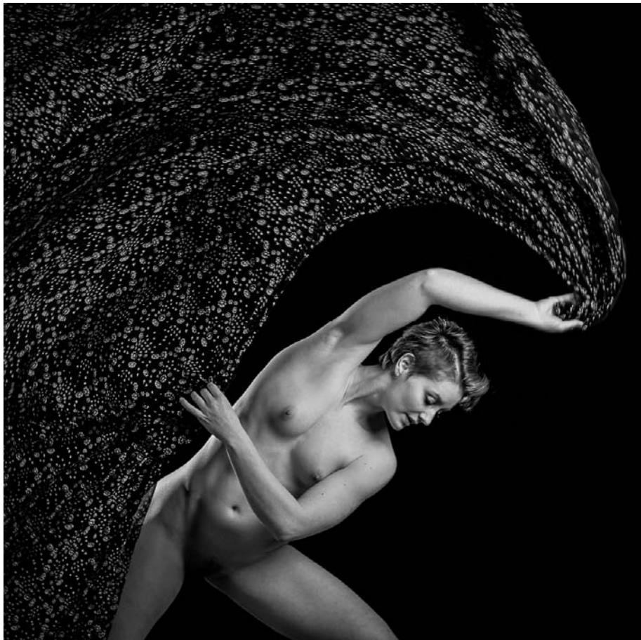
August mono PDI of the month TengTan Overarching