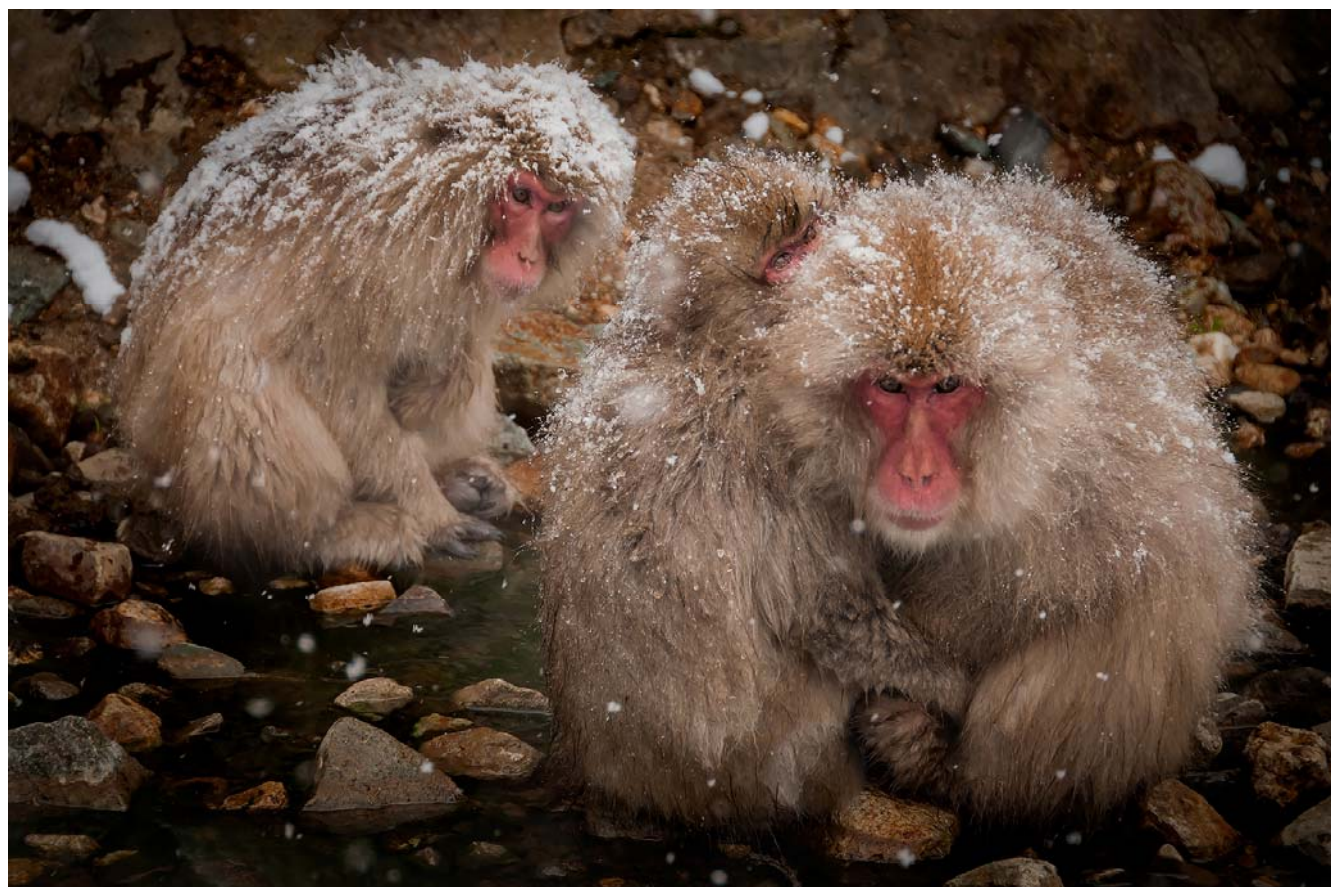
September colour PDI of the month Tuck Leong Snow Monkey's Family