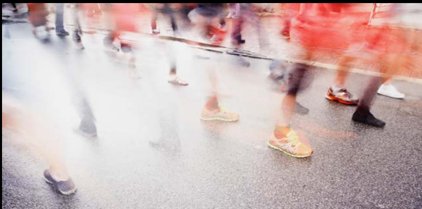
Marg Huxtable Walk on By 9