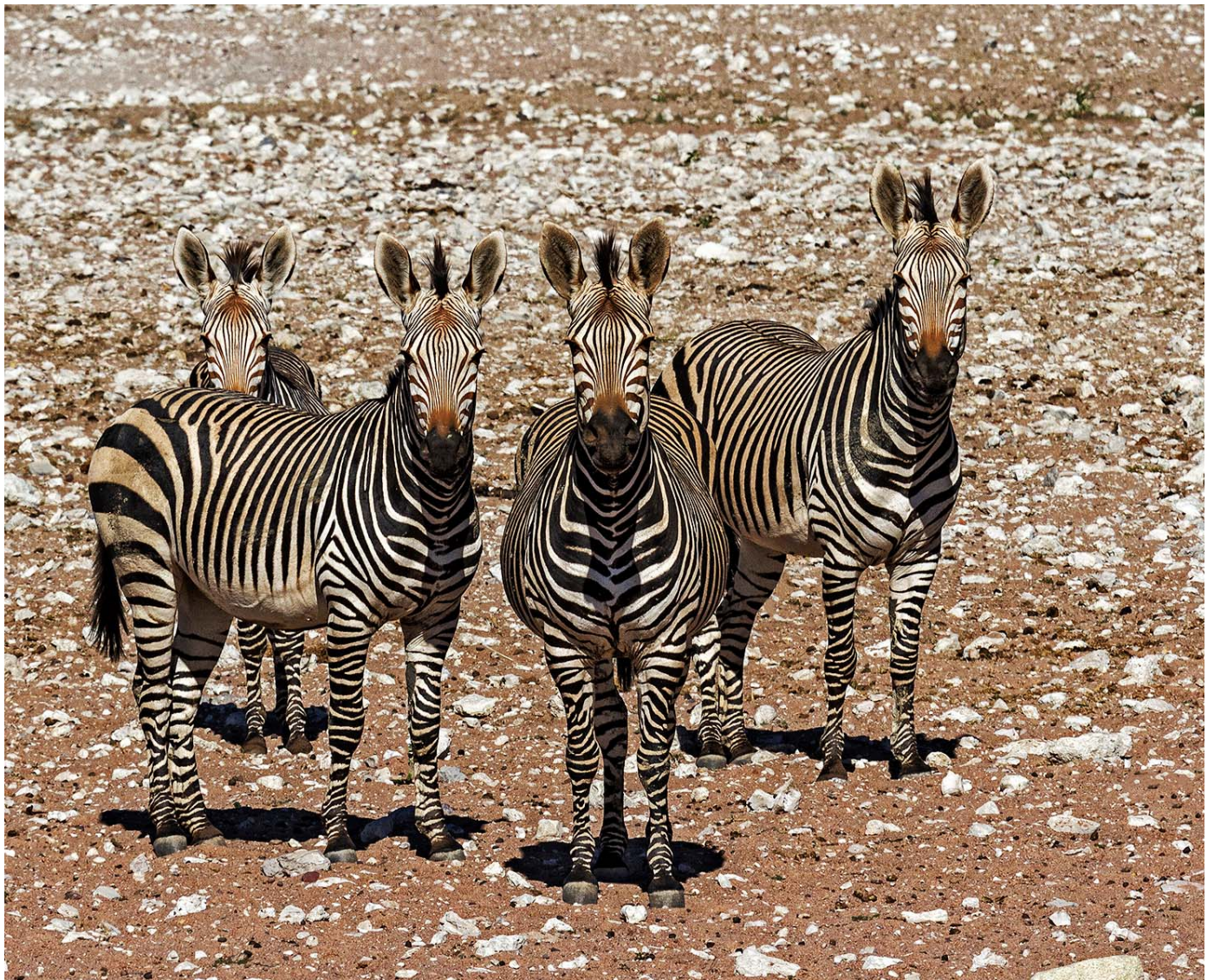
Ted Rotheram Trophy