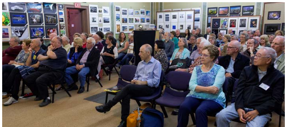
A capacity crowd at the MCC presentation night on 11 December, 2014.