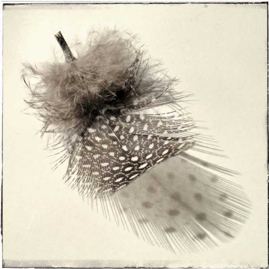
Best Open EDI and Projected Image of the Year

The Board is still awaiting an engineers report before we can embark on the renovations; unfortunately the hold up is due to a serious accident suffered by the inspecting engineer so another had to be commissioned. The program committee has put together an exciting program for 2015 with technical skills nights a focus. The Introductory Photography course begins the first week February and is fully subscribed. Please make the attendees feel welcome and encourage them to attend club functions. We were very pleased to see so many members at the end of year social and at promotions night giving both nights a vibrant and collegial atmosphere.