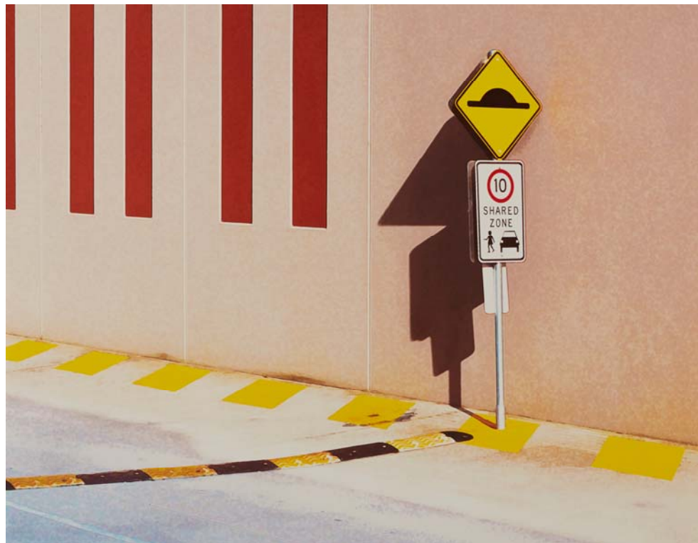
Best Special Set Subject - After Jeffrey Smart