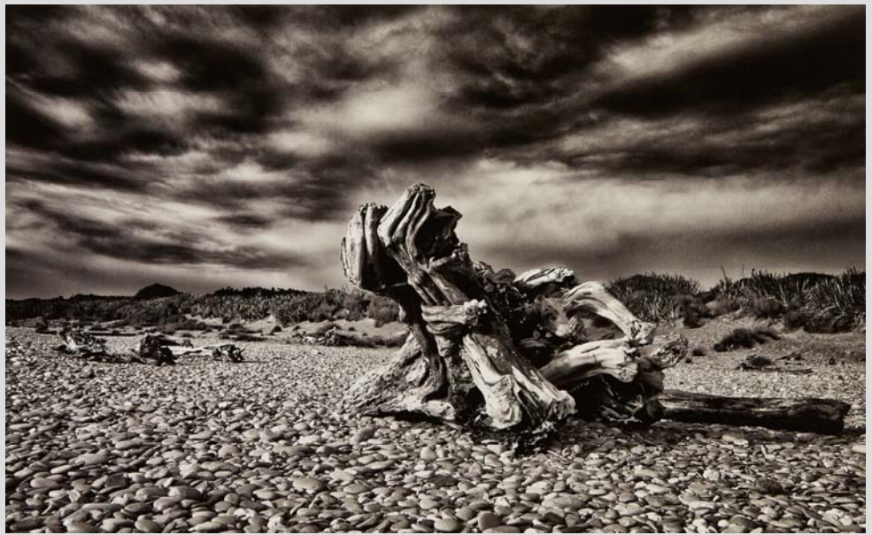
Photography is Fun Trophy - The Bockey