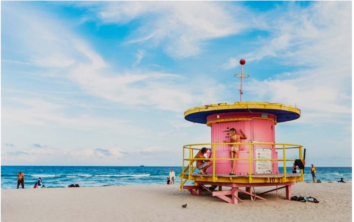
Best Photojournalism Print and L.A. Baillot Trophy Judi Mowlem South Beach Babe