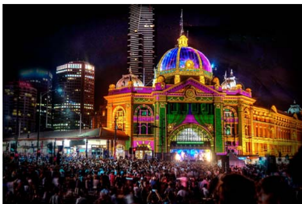
Flinders St 12.50