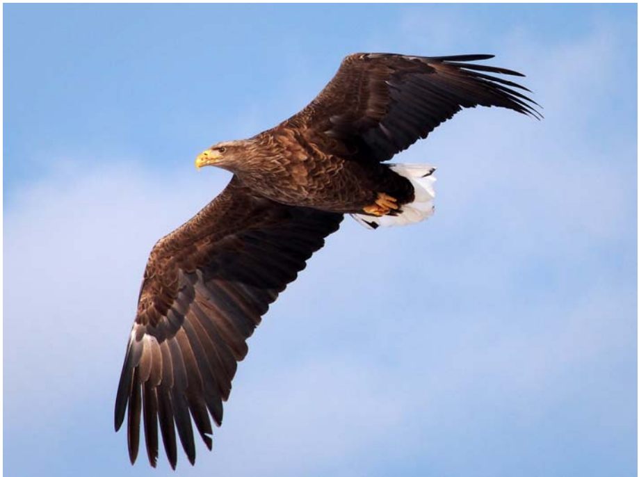
May Colour Print of Month Marg Huxtable White tailed sea eagle