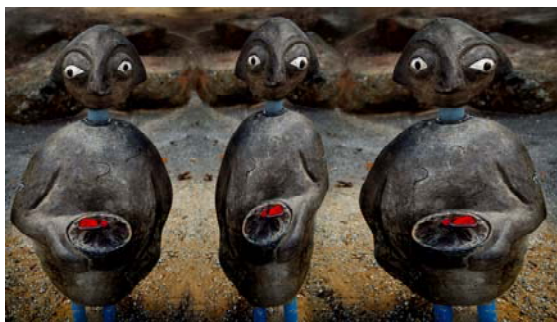
One Sculpture and a bit of fun with Photoshop Canon 5D (MC)

flash photography and the lighting of people and objects. Subjects requiring for example macro photography, immediately bring to the fore "depth of field". Mastering it in macro work certainly has benefits in the rest of photography. A recent development has been the use of filters in our landscape photography.