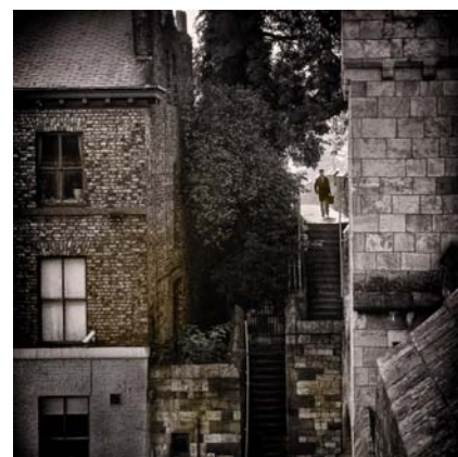
The Art of Observation