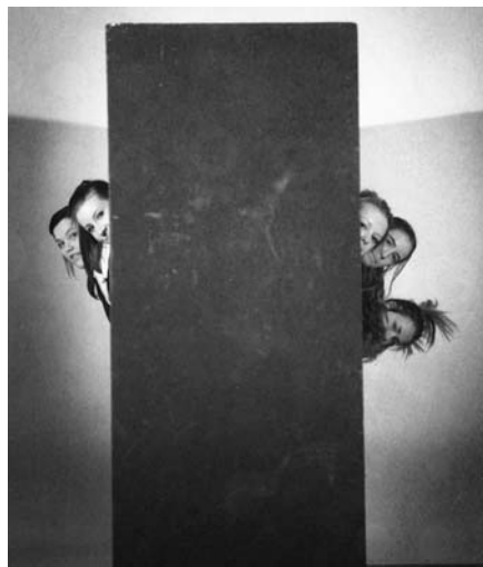
Peek-a-boo - Studio Group 2

On Day 2, we helped each student print the frame of choice. While the printing was going on, the rest of the group got involved in Studio shooting – David's great solution to keeping a group of kids occupied. We simply set up a couple of tungsten lights and gave them our Rollicflex TLR to use. The shots they took speak for themselves – fun and inventive compositions even if, at times, not too sharp.