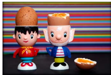
Macro Shot with Natural Light - (MC)

The Monthly Competitions and the comments from the judges were the next phase in our education. In July 2008 the Canon Powershot moved aside for a Pentax K20D with an 18-250 mm lens. Our faithful film camera was retired to a bottom drawer minus its lens which was