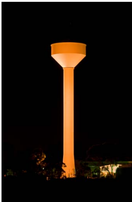
Mildura Water Tower

I like taking photographs that I can look at over and over again and not get bored with. It's a real bonus when other people have the same reaction. It's a