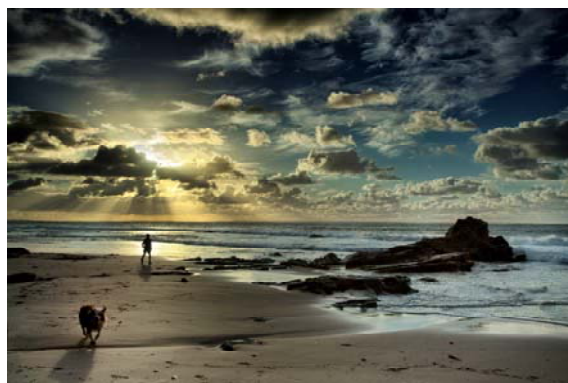
Sunrise - Canon 5D

work, their encouragement and support. Thank you to those club members who have shared their knowledge and skills and who have gone out of their way to teach us so much.