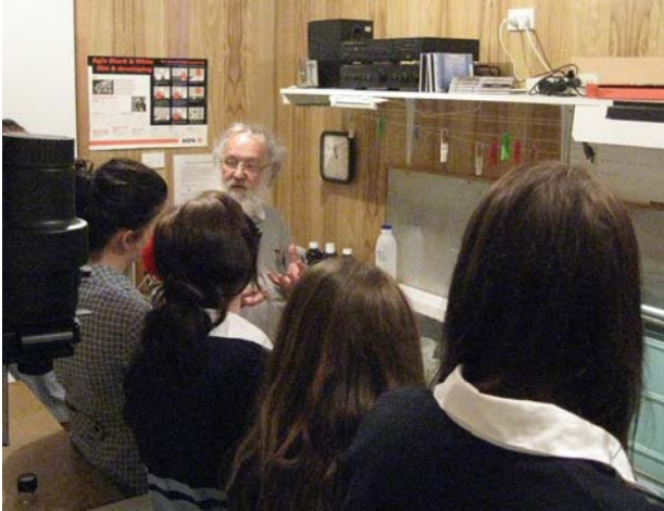
In the darkroom