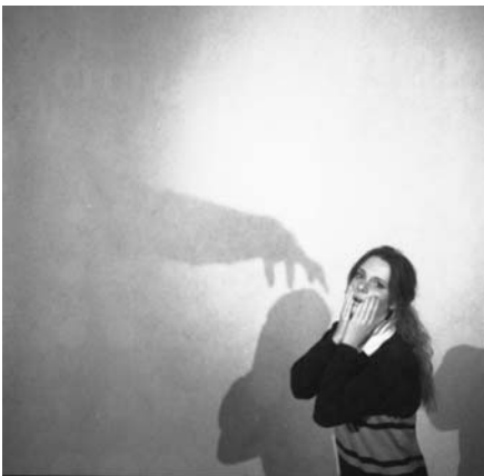
Oh help me! - Studio Group 2

The two day workshop began with a camera plus a roll of film and ended with a strip of negatives, a contact print and an 8x10 print – plus a lot of fun. Four members of the Traditional