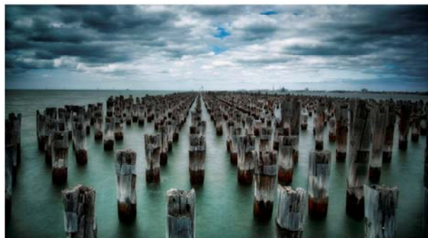
Princes Pier using 10 Stop Filter- Canon 5D (MC)

focus on a particular style of photography. We will continue to pursue all areas and styles as this fits with our belief that each area has its own set of skills to master and that these skills are transferable and in striving to attain competence we will hopefully become better photographers. Concentrating on one area we believe would be detrimental to our overall development as photographers at this time. This is not to say that some areas interest us a little more than others. Jane for example really likes texture and form in more abstract images and mood or light in landscapes. Martin enjoys photographing