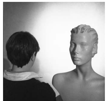
You and him - Studio Group 1

But the success was also shown by the fact we had only 8 students arrive for the first workshop – there should have been 16 – then we had 15 out of 17 students arrive for the second workshop. To participate, they had to get to Frankston Station by 7.30am! The word of mouth (maybe social media) was that this was a cool activity.