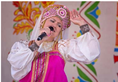
Live gig - Federation Square using Natural Light - Canon 5D (JC)

Jane decided she wanted to learn to take better photographs. She had caught the "bug". The first stage in her education was a short adult education course in photography which resulted in more confusion than knowledge. Searching around Jane came across the Essendon Camera Club and their course "Photography Techniques – your next steps moving beyond Point and Shoot".