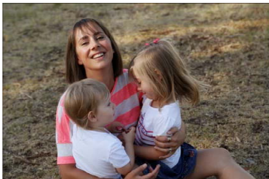
Photoshoot for daughter for her Business Website using natural light - Canon 5D (MC)

focus on a particular style of photography. We will continue to pursue all areas and styles as this fits with our belief that each area has its own set of skills to master and that these skills are transferable and in striving to attain competence we will hopefully become better photographers. Concentrating on one area we believe would be detrimental to our overall development as photographers at this time. This is not to say that some areas interest us a little more than others. Jane for example really likes texture and form in more abstract images and mood or light in landscapes. Martin enjoys photographing