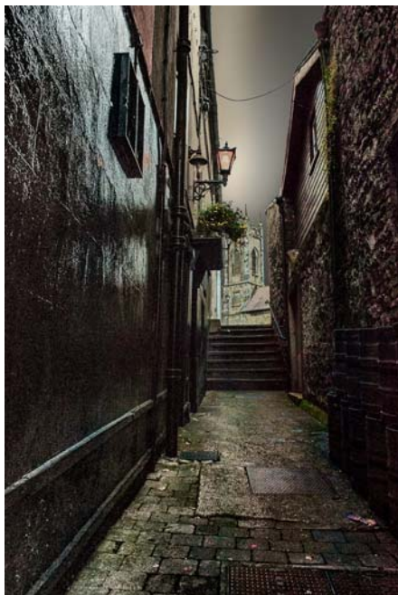
Light and Shadow

digital cameras came onto the market, my first being a Minolta Prosumer camera. Wonderful freeing experience to take