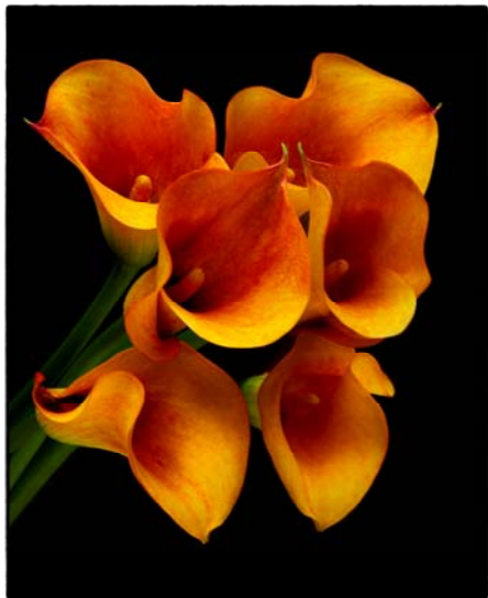
Three Calla Reflections using Natural Light and a Reflector (JC)

We all know that every journey starts with the first steps. We often have expectations about the end of the journey and the possibilities along the way but don't really expect everything to go to plan. Our journey into the world of photography has all these characteristics.