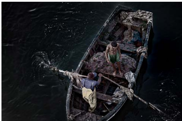
Anything but ordinary

M y interest in photography began about 30 years ago. Bought my first camera about 15 years ago. Pentax film camera. My enthusiasm was sparked once