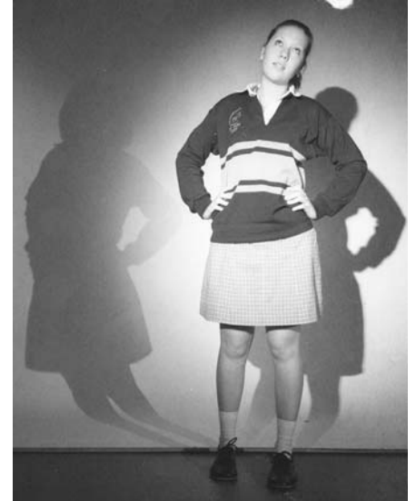
Me and my shadows - Studio Group 1

The students were fascinated by the cameras. We set up a 4x5 large format camera as well as the TDPG Rollicflex and I had an Argus Matchmatic 'brick', the model used in one of the Harry Potter movies, available for them to handle. When offered a camera to use to take their shots on Day 1, they all wanted to use an SLR that was basically manual. Two or three students had to be happy with an analogue point-and-shoot as we ran out of SLRs. (And I had to give up my Minolta X700 and use a point-