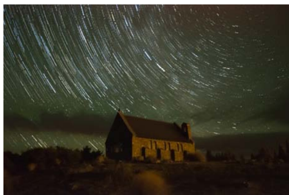
Church of the Good Shepherd, Lake Tekapo

(HDR) processing and Tone Mapping. My favourite image is usually the latest one I'm entering for competition night.