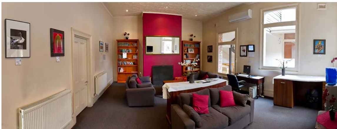
MCC's BIFB exhibition Many views, one vision at the Ansonia