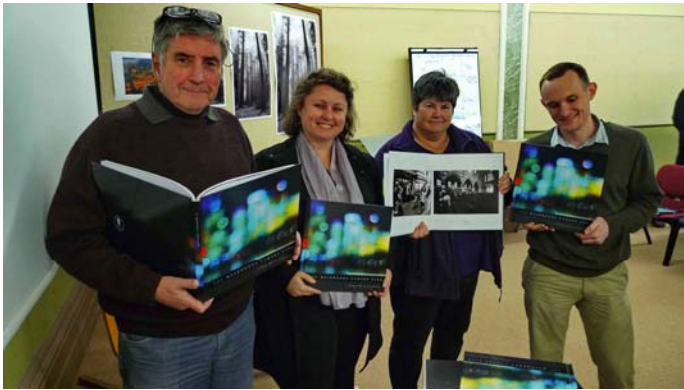
Committee that produced the book