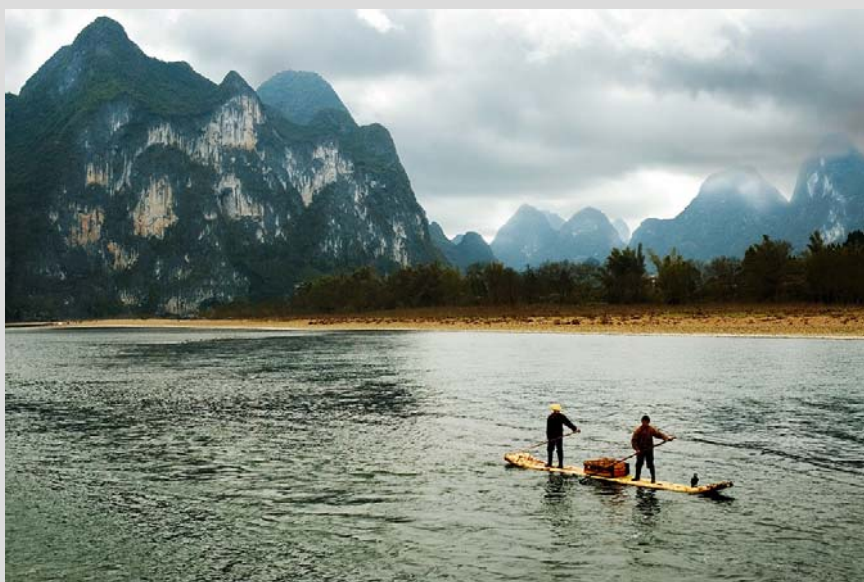
Ping Pan Frew