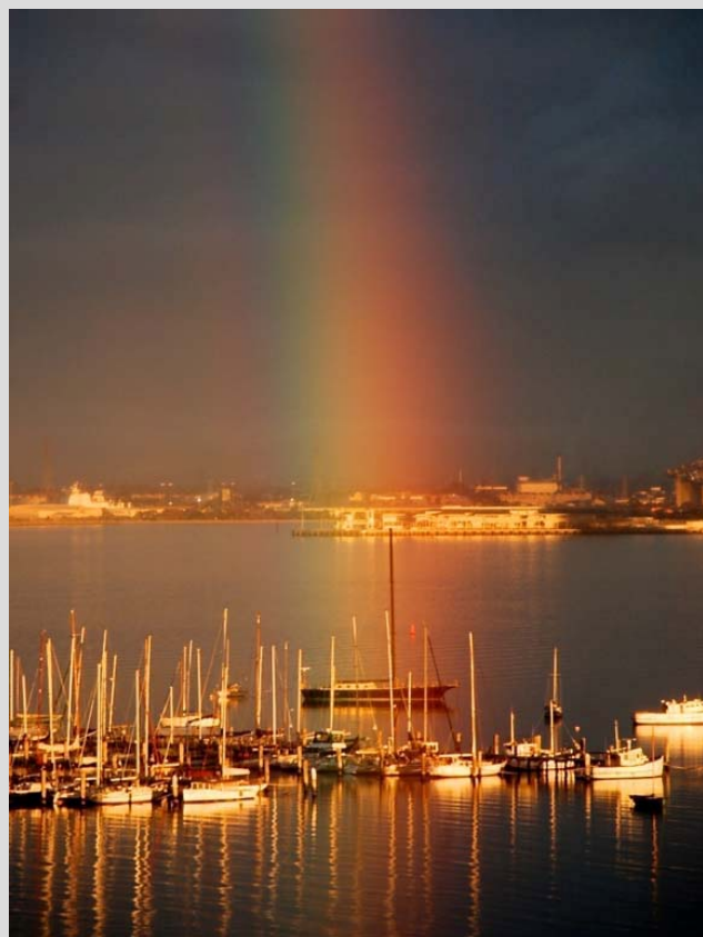
Reuben Glass St Kilda