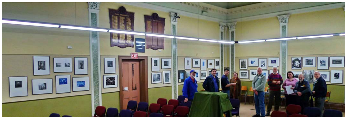
TDPG Exhibition