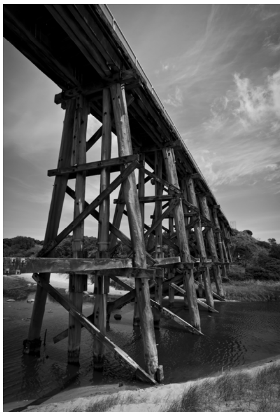
Norman Blaikie Kilcunda trestle bridge September Mono print of the month